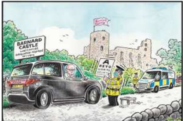
‘Come on, Mr Cummings, have another go at reading the bottom line’

There are many unanswered questions around PPE and the disgraceful way our elderly residents in care homes were treat-