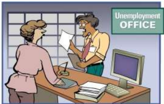
"I didn't lose my job. I know exactly where it went. Here's the address in Birmingham!"

I am now entering the last six months of my elected term and I thank all of you who voted for me last time. I will be standing again later this year and would really appreciate your vote again, allowing this branch to have representation on the executive. I have in this time spoken and helped many of you and I wish you all good luck, stay safe and well. Let us hope that this pandemic is over and we can return to normal within a matter of months.